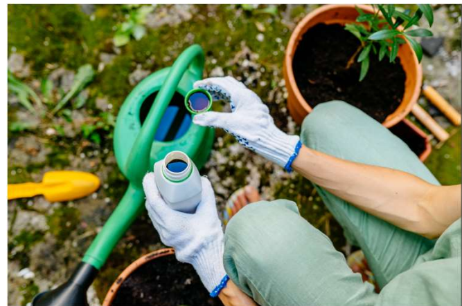
Mixable with water/fertilizer